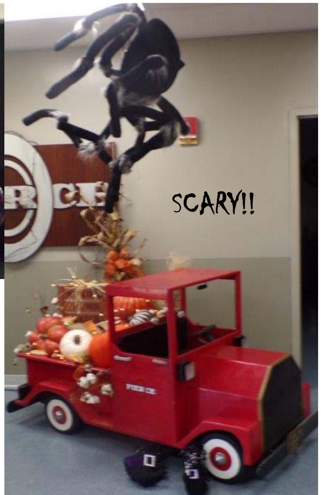
Huge Spider Dropping from Lobby Ceiling & Pierce Truck Running Over the Witch

As Ripley's Plant 7 prepares for "Trick or Treating" activities, our Plant Lobby is prepared as a huge black spiders dangles from the ceiling as our Pierce truck is guilty of "running over" the witch (witches shoes under the wheels of the truck). HAPPY HALLOWEEN!