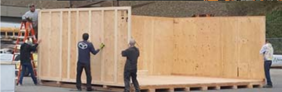
Getting her crate all ready so we can transport her safely.