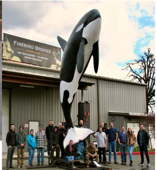
Above, the painted, finished product at Firebird Bronze. To see more, go to firebirdbronze.com .