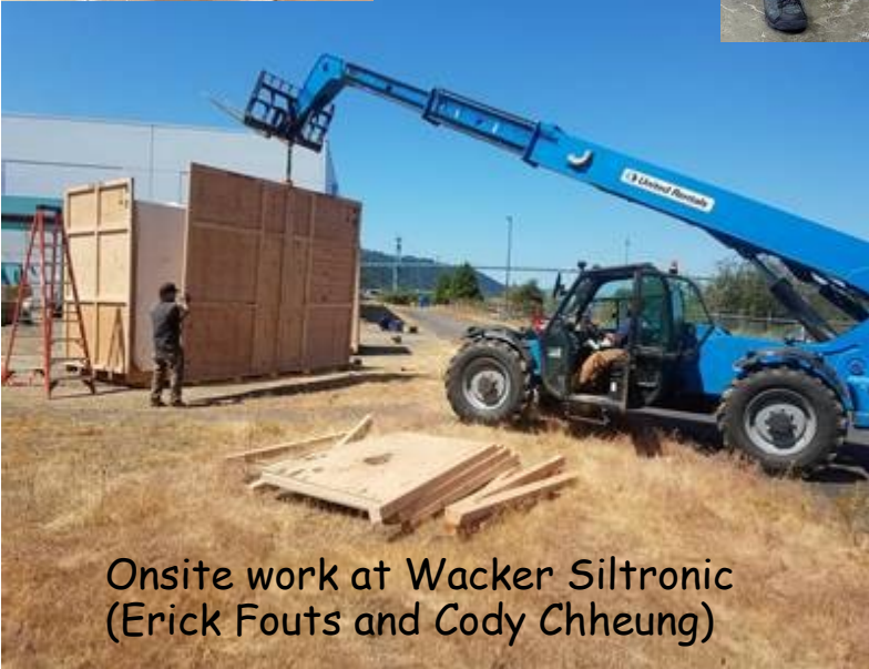
Onsite work at Wacker Siltronic (Erick Fouts and Cody Chheung)