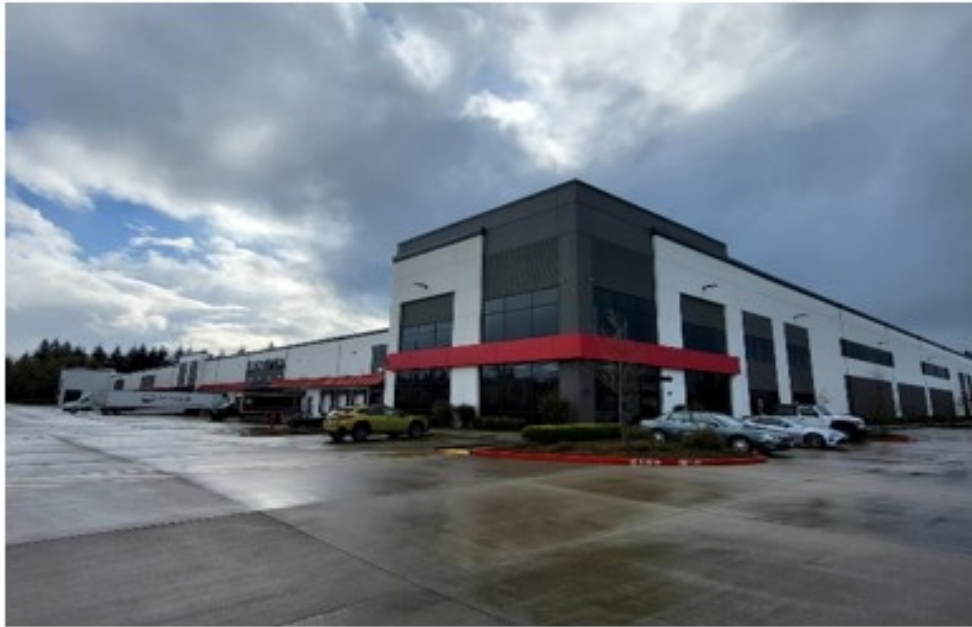
-Plant-8 Dupont, WA

The rain stops for a moment in DuPont WA.