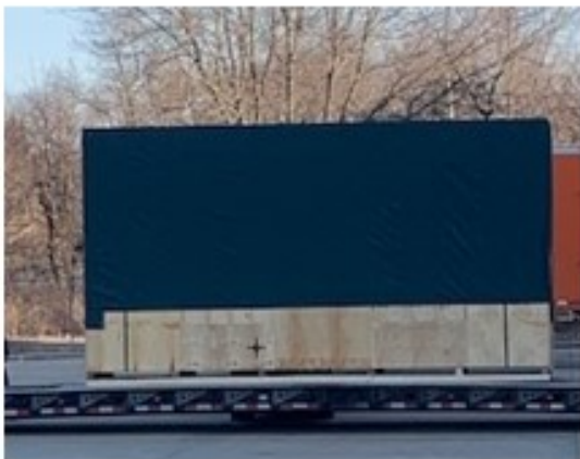
Out the door, on the flatbed and ready to go.