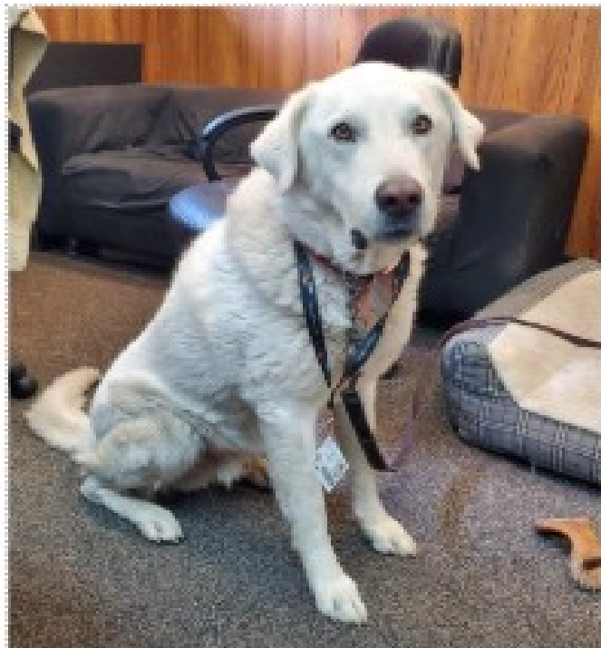
Apollo 5 years