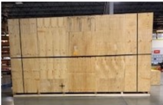
Ready to ship.